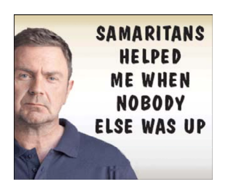
ADS BY GOOGLE >