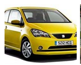
Discover the VW Up! Alternative Ambulance Takes OVER An Without the Price-tag (SEAT on WhatCar)