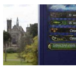
Alton Towers ride evacuated a week after rollercoaster crash